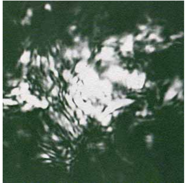
Figure 1 – Effect of Scintillation or Optical Turbulence on an optical beam after traveling through the atmosphere.

The optical flow sensor uses optical scintillation as the detection method. Scintillation is a general term, which describes changes in the apparent position or brightness of an object when viewed through the atmosphere. Starlight twinkling is a common example of scintillation. Scintillation effects are caused by optical refraction occurring in small parcels of air whose temperature and density differ from their surroundings. Figure 1 shows the effect of scintillation or optical turbulence on an optical beam after traveling through the atmosphere. If there is no atmosphere, the beam pattern should be a uniform circular disc. The atmospheric turbulence produced the intensity fluctuations as shown. The receiver detects this beam and reconverts it to an electronic signal. Intensity variations of the detected signals caused by the scintillating air parcels provide the basis of the turbulence measurement. The twin modules in the receiver furnish the capability of measuring cross wind by detecting the temporal correlation between the two signals as the air parcels move across the beam path (covariance). The movement of the scintillation from one receiver to the next is related to the flow rate.